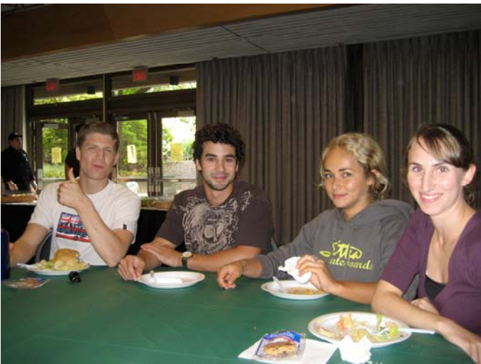
Welcoming BBQ, September 10, 2009